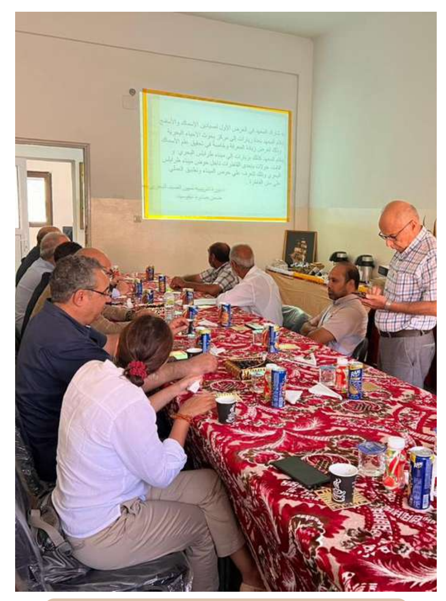
Fishery Training Center Suq Al Jum'a