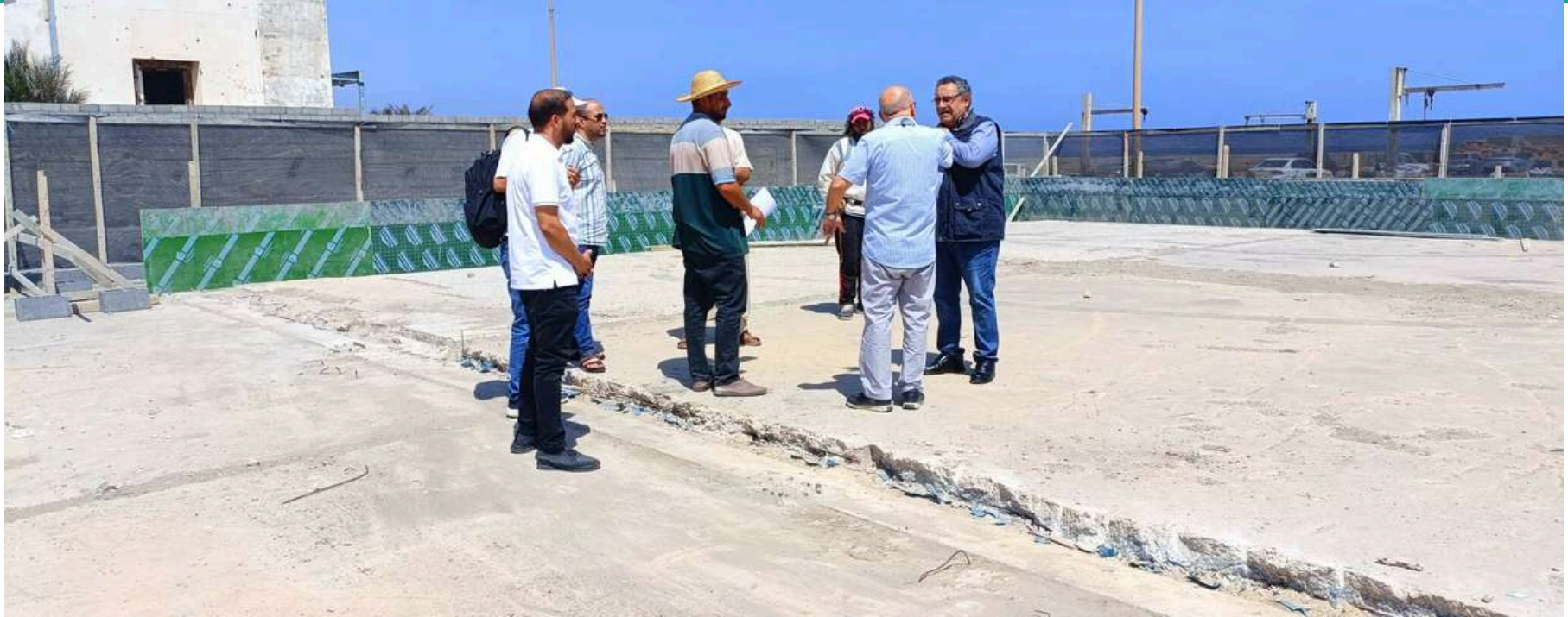
Visit to the construction site