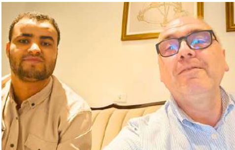
Meeting with the 2 veterinarians