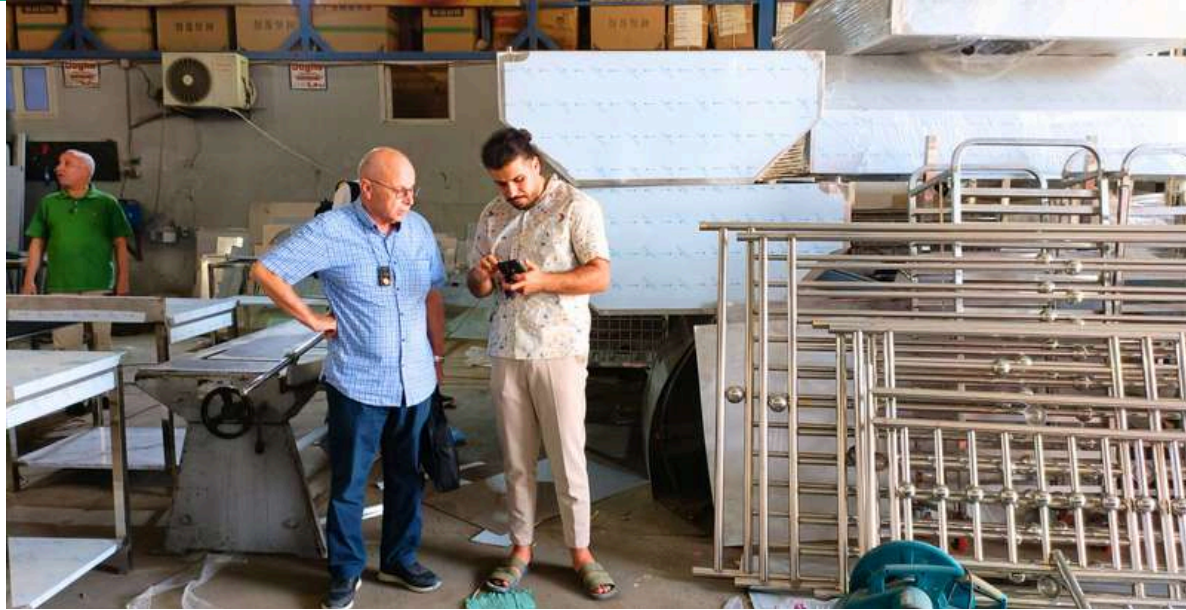
Visits to suppliers and partners