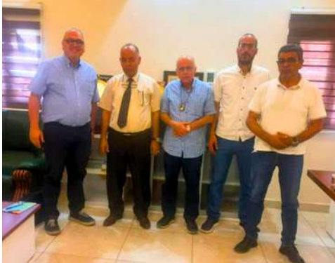
Meeting with director of Food & Drug Network of Laboratories